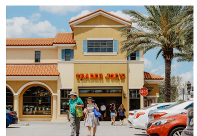
LAKEWIDE WINTER PARK